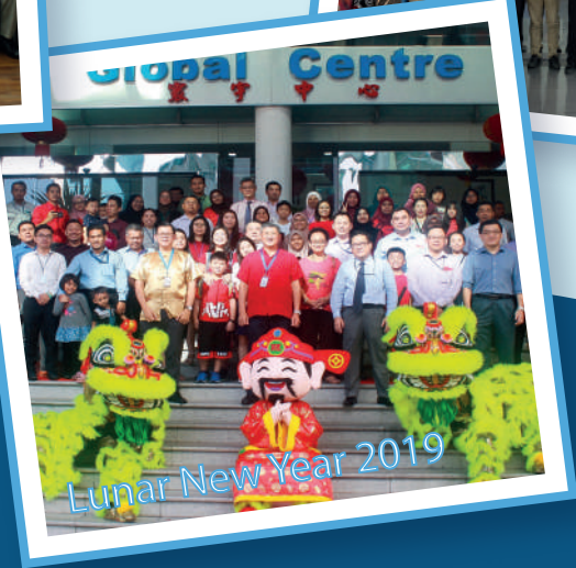
Lunar New Year 2019