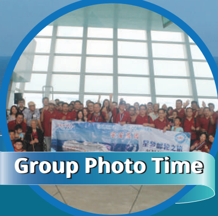
Group Photo Time