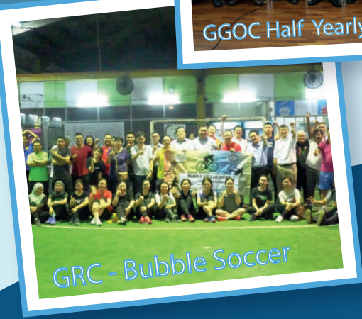
GRC - Bubble Soccer