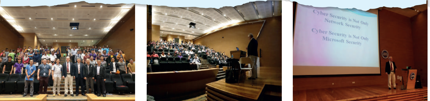
Cyber Security Seminar (DEFENCE IN DEEP STRATEGY) University College of Technology Sarawak