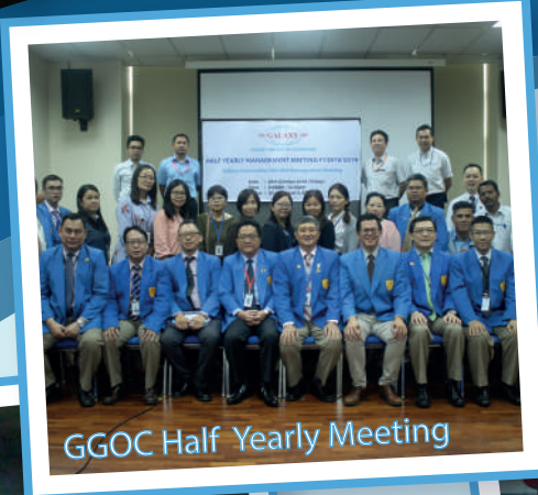
GGOC Half Yearly Meeting