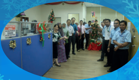
GA Technical Department