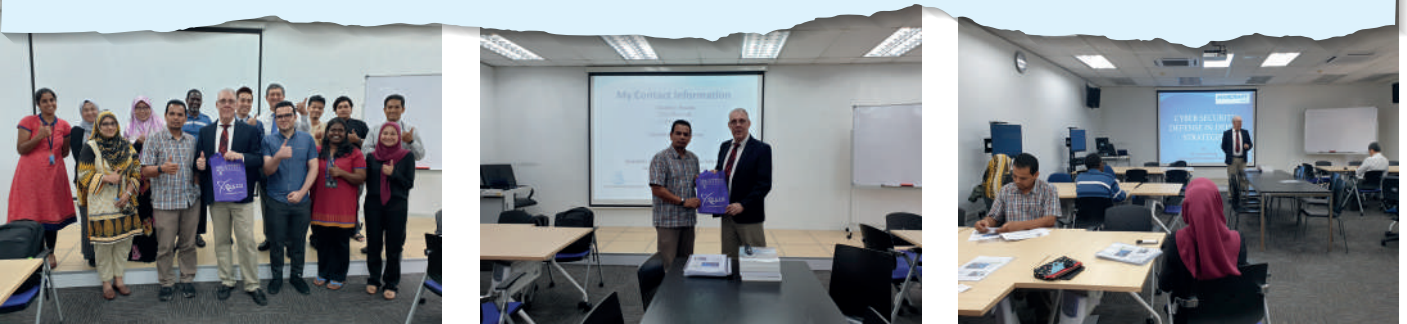
Cyber Security Seminar University Malaya