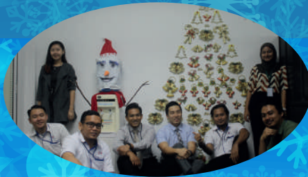
Scientific & Technical Department