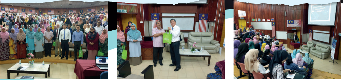
Cyber Security Seminar Polytechnic Sultan Abdul Halim Mu'adzam Shah