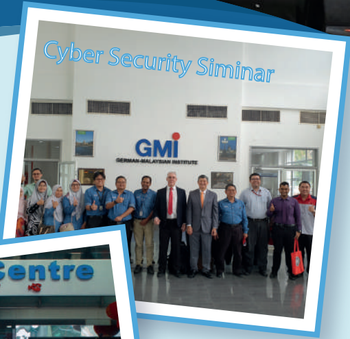
Cyber Security Seminar