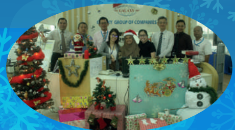
GA - Sales Department